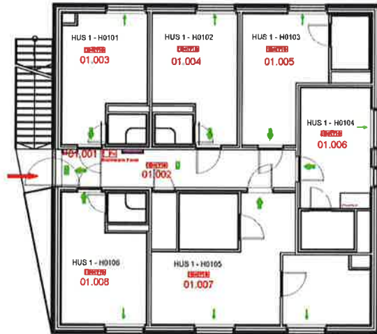
ORIENTERINGSPLAN -ENKLETT+ UU 1. ETG.